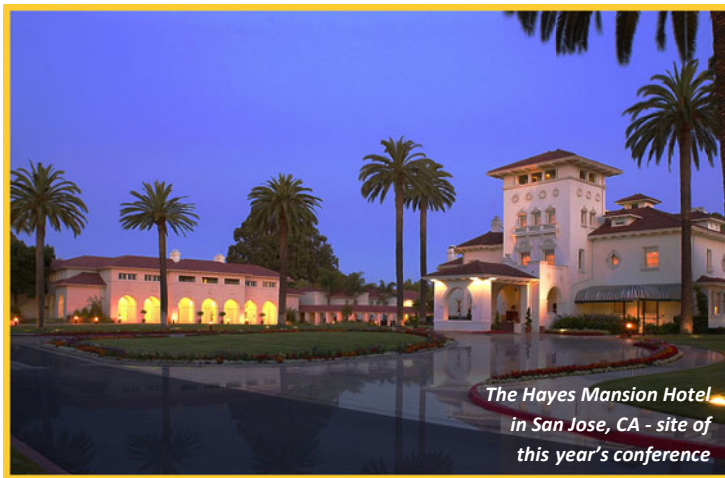
The Hayes Mansion Hotel in San Jose, CA - site of this year's conference